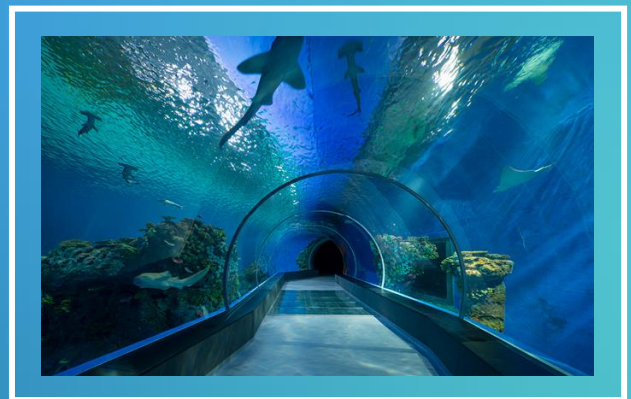
ZOO and Aquarium (3 kilometres)