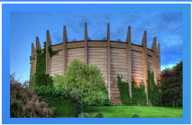
The Raclavice Panorama (100 metres)